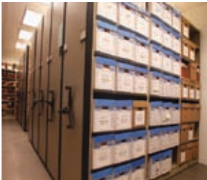
ARCHIVE BOX STORAGE