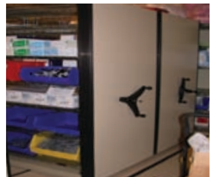
MISCELLANEOUS SHOP STORAGE

Call today for your free consultation, layout and design services.