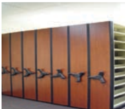
BANK CHECK BOX STORAGE