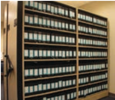
CHOIR MUSIC STORAGE

See the examples below of mixed media storage applications.