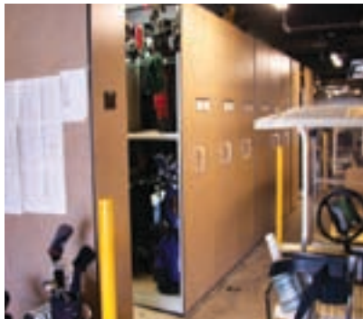
GOLF BAG STORAGE