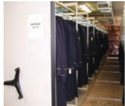
MILITARY UNIFORM STORAGE